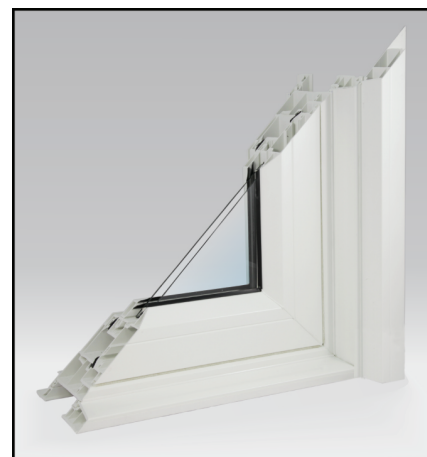
Antartik system allows the insulation cavity to be filled in.